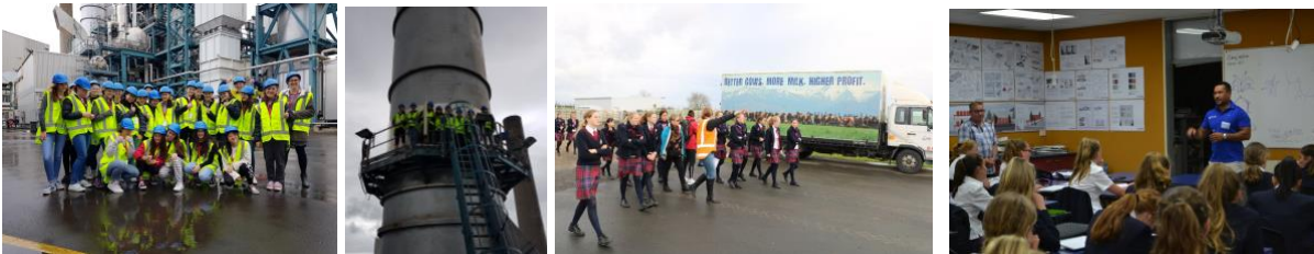
Waikato Diocesan School for Girls experiencing science and technology through Contact Energy, CRV Ambreed and Boffa Miskell

"I liked meeting people who use what we learn in class on a daily basis in their careers because it helped me find a purpose for what we are learning." (Waikato Diocesan School for Girls student)