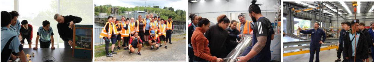
Huntly College students and teachers experiencing 'real world' maths and science at Mercury and Waikato Milking Systems

"It was fascinating to learn about the different careers and it also helped me broaden my scale of job choices. It inspired me to think more about what I would like to do." (Huntly College student)