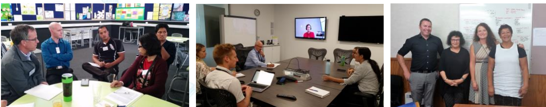
Teachers and employers collaborate to create contextual learning opportunities for students